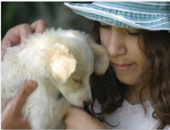
Adoption Days and New Families

Space does not permit us to list all the many wonderful people through the years who have supported our efforts. Below are just a few, but please know that we value each and every one of our members and deeply appreciate your contributions, which have made everything we do possible: