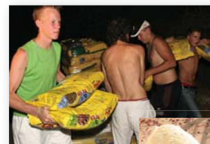
Rescues Under Fire